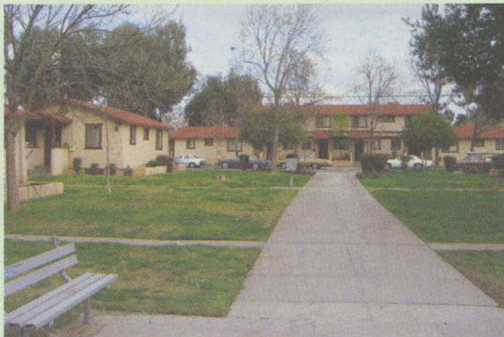
Funston Place, a low-income housing development, was demolished to make way for Parc Grove Commons II.

The site of the project - Parc Grove | 3