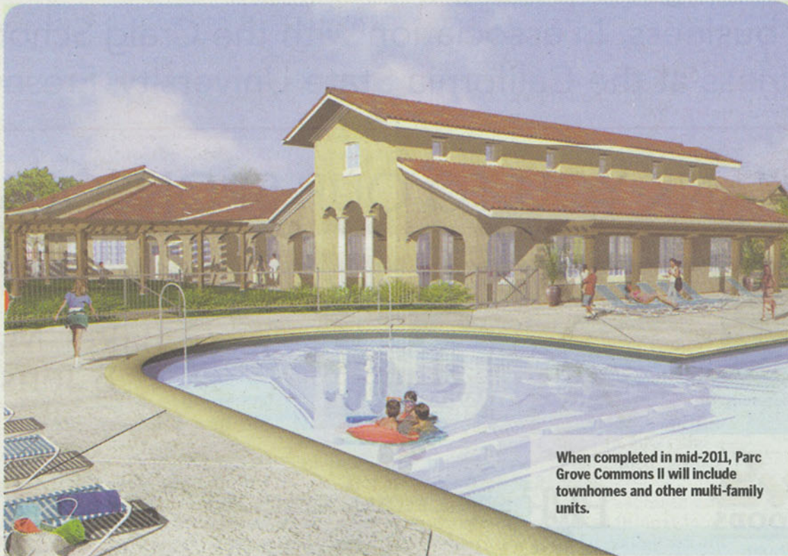
When completed in mid-2011, Parc Grove Commons II will include townhomes and other multi-family units.